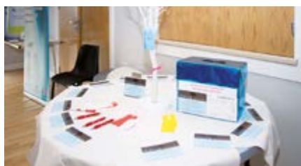
Give us your ideas

"It is this kind of dedication we are endeavouring to replicate in other walks of life by tapping into the skills and enthusiasm of people in communities across Glasgow where we have our homes. We know from the initial response to