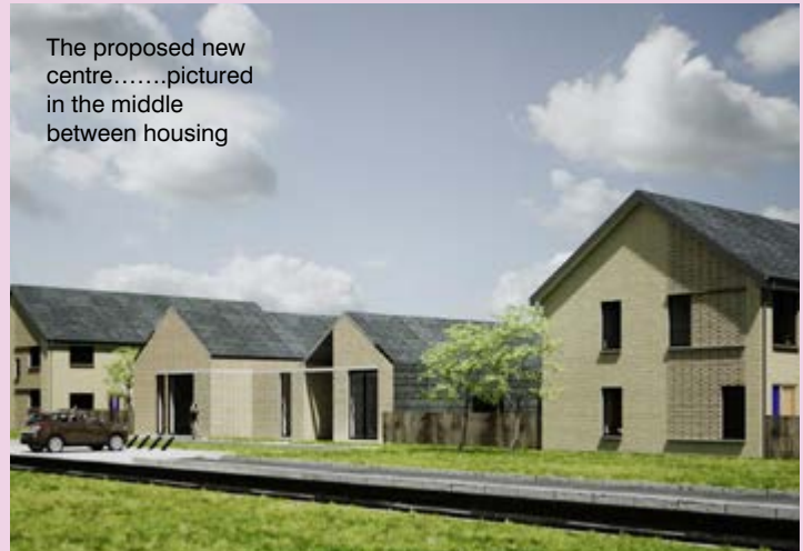
The proposed new centre.....pictured in the middle between housing

Netherholm Area Association have been working very closely with us to help us apply for funding to build a much needed Community Facility in the area. The application was submitted to the Big Lottery at the beginning of May with a decision being reached in August. If we are successful the building work will start in November with the proposed completion date being August 2017. We would like to thank Netherholm Area Association for all of their effort and hard work and we look forward to continuing our work together. The group have been busy working with local partners including Urban Fox, Streetwise, Jeely Piece, Smart Communities and Coderdojo to bring new and exciting services to the community.