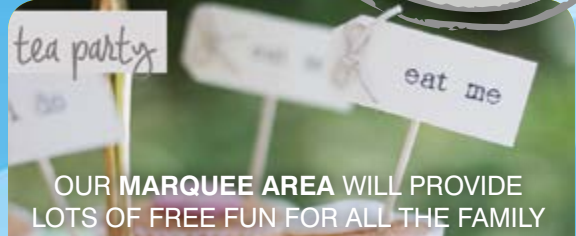
OUR MARQUEE AREA WILL PROVIDE LOTS OF FREE FUN FOR ALL THE FAMILY

Some of the pictures on this page show you how much fun we all had last July. And here's some of the things that will be going on and there's the chance to win driving lessons in our fabulous free prize draw!