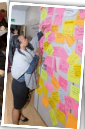
What you had to say