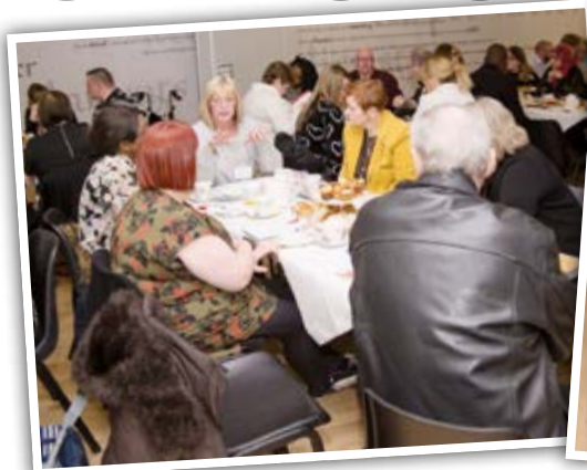
A great turnout at the launch