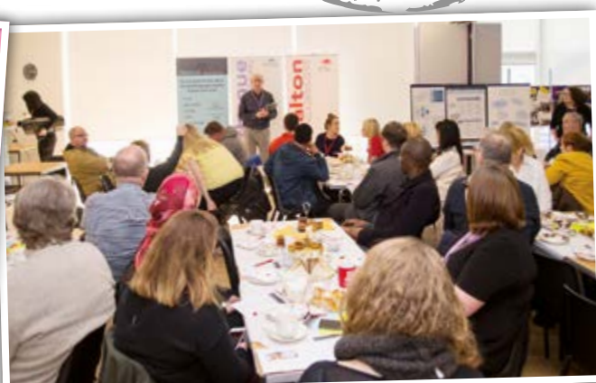
Here's what we're saying

Thenue's Volunteering drive is already bringing results – and helping people doing their bit to feel valued members of the community, too!