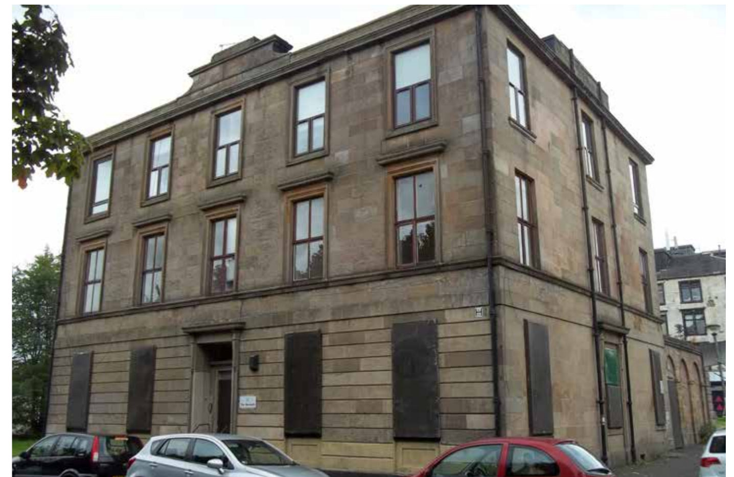
The former Monteith hotel just before work got under way

If this can be done it will be great for Castlemilk and would undoubtedly be a success.