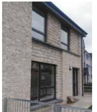
The homes at Castlemilk