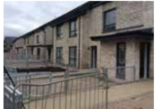
The homes at Bridgeton

We readily acknowledge the involvement of Glasgow City Council and the Scottish Government in helping to fund these important projects which will make a real difference to people's lives.